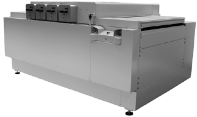
Typical Set-Stack Unit